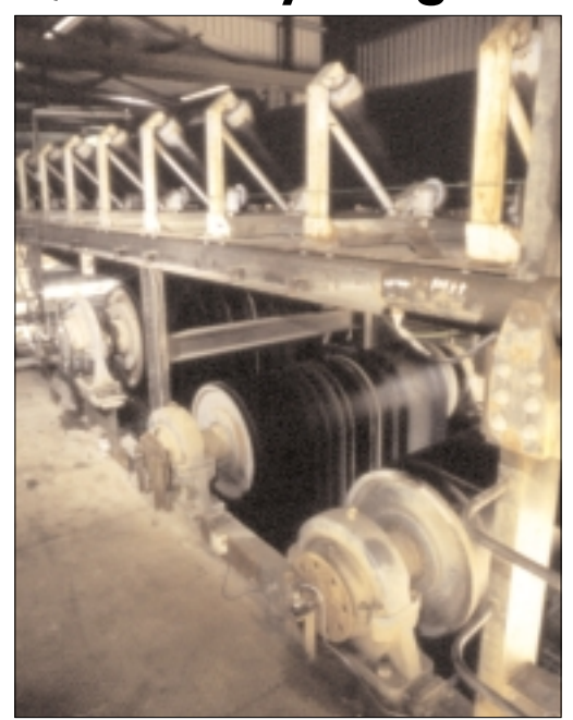
Inspection and preventative maintenance are kept to the minimum regardless of the application or bearing size.