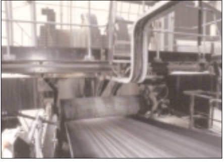
Cooper bearings are completely accessible at all times for cost effective maintenance and maximum safety compliance on any type of application.